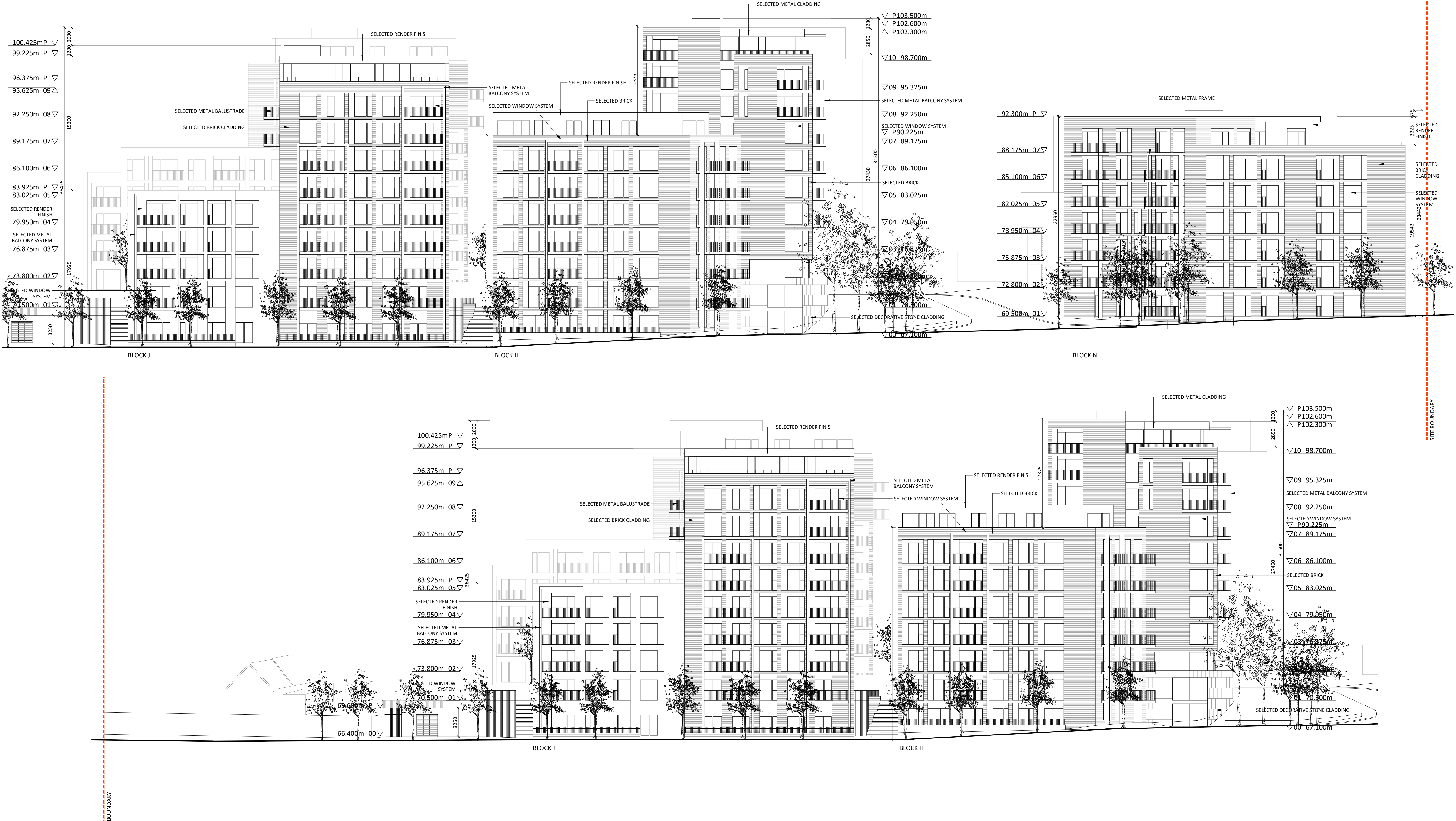
Northwest Elevation to Brewery Road